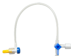
A. HVA – Hemostasis Valve Adapter