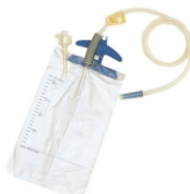
E. WATER SEALED DRAINAGE BAG