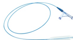
C. PTA CATHETERS